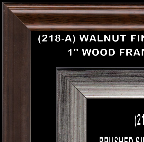
(218-A) WALNUT FINISHED 1" WOOD FRAME