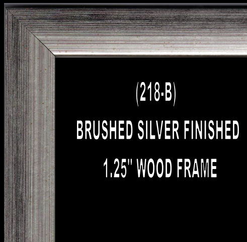
(218-B) BRUSHED SILVER FINISHED 1.25" WOOD FRAME

(3) Double Matted Giclee' Prints on 61# Acid Free Paper with Certificate of Authenticity.